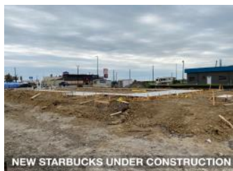
NEW STARBUCKS UNDER CONSTRUCTION