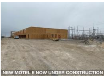
NEW MOTEL 6 NOW UNDER CONSTRUCTION

In sum, the economic outlook for Aransas Pass is very bright.