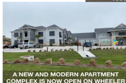
A NEW AND MODERN APARTMENT COMPLEX IS NOW OPEN ON WHEELER