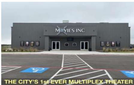
THE CITY'S 1st EVER MULTIPLEX THEATER