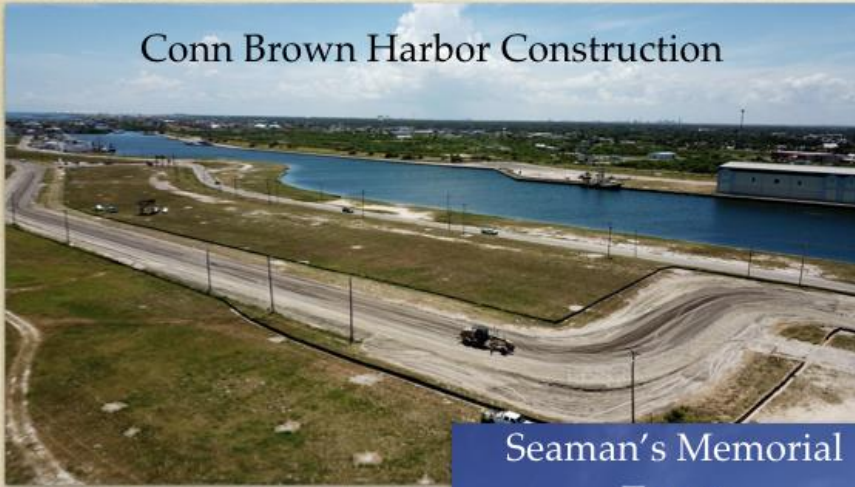
Conn Brown Harbor Construction