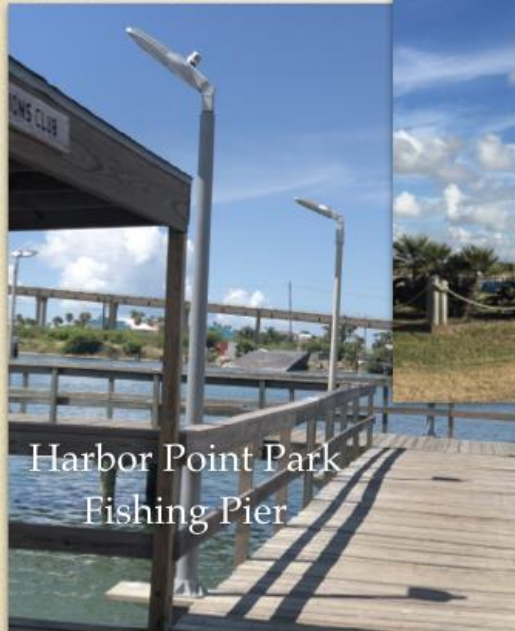
Harbor Point Park Fishing Pier