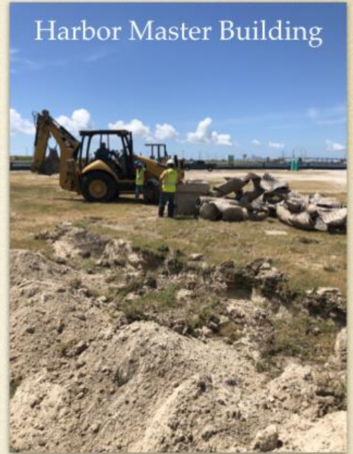
Harbor Master Building